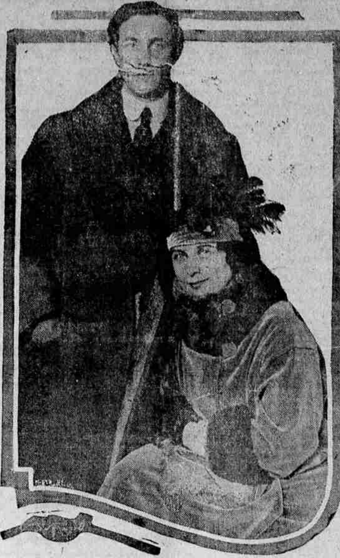
Lou-Tellegen. Geraldine Farrar. Geraldine Farrar, famous singer, who has been reported engaged to a half dozen persons, including some princes and dukes, went to the office of the city clerk in New York, Monday, Feb. 7, and obtained her license to wed Lou-Tellegen, the actor. This photograph shows the pair just after they got the license.