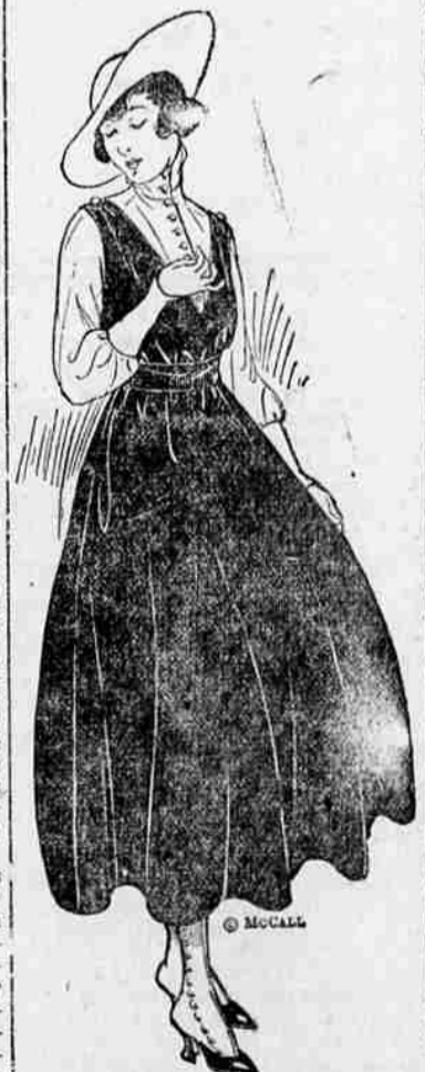
Black Taffeta Jumper Dress