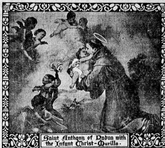
Saint Anthony of Padua with the Infant Christ - Murillo