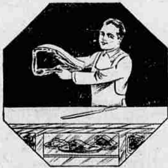
HOLDING UP THE QUALITY

of our meat supply is, to say the least, a hard matter. We accomplish this through the adoption of rigid inspection before purchasing. We accept nothing but prime beef and other meats from the buyers. Therefore you're safe in buying here.