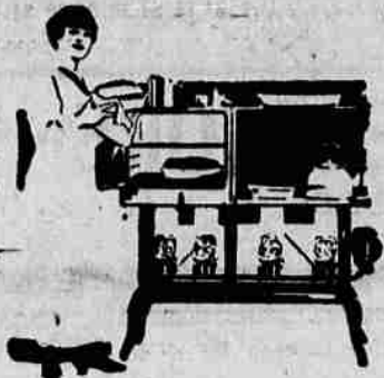
Gas Stove Convenience with Kerosene