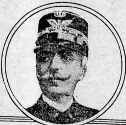
Gen. Cadorna, Chief of Staff

The brother of the King, the Duke D'Abuzzi, leads the fleet, and General Cadorna, chief of staff, leads the army. The duke is well known to Americans because of his attempt to wed the daughter of a millionaire member of the United States Senate. He didn't wed because the royal family would not think of permitting American blood to be mixed with royalty; and he did not make up his mind to defy his royal relatives.