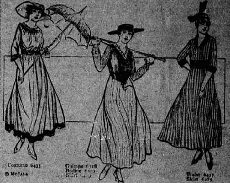
15c each for these McCall Designs—Make one up yourself—It will surely please you.

The latest styles, Empire and Bolero effects, flowing sleeves, full skirts. Tailored and simple plain co-stumes, suitable for development in Silks, Linens, Serges and the new Cotton fabrics, are found in widest selection in the new McCall Patterns now on sale.