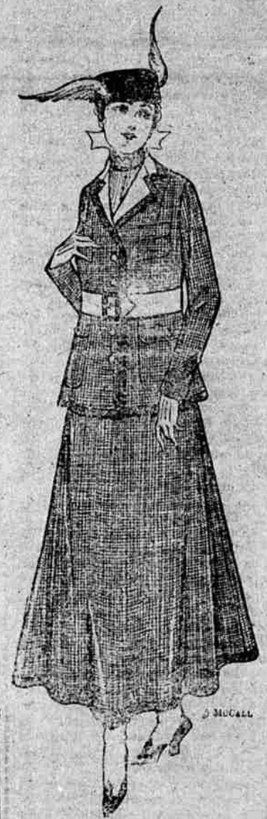
A Military Model of Blue Gabardine

New York, Apr. 24.—Now that Easter is past history and the smart women has placed her stamp of approval on this style and that by actual wearing, street clothes resolve themselves into two distinct types, the tailored and semi-tailored suits. Perhaps it is the anticipation of a cross-continent trip to the Fair that is making the tailored suit so popular of it may be mildly on charity bent finds the plain coat and short skirt in keep-