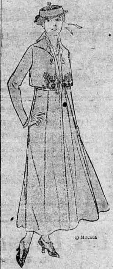
Zouave Jacket and Pleated Skirt Made in the New Mouse-Gray Faille