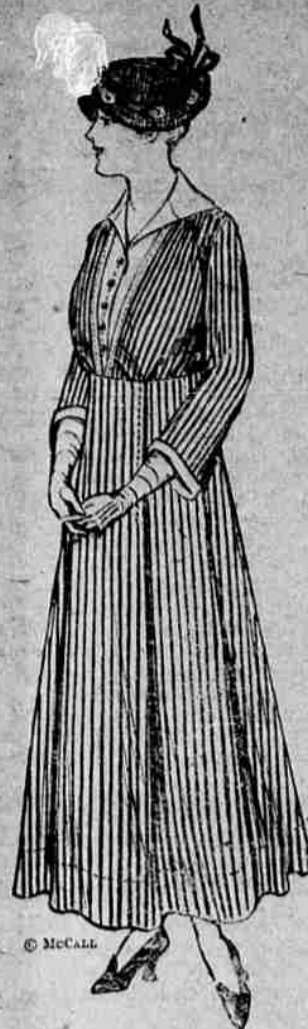
An Effective Striped Linen, with Organdy Vest and the New Bell Showing the Cuffs

blue polka-dotted skirt with fullness held in at the waistline, trimmed with two scant ruffles on the lower edge. A waist in Eton effect is of plain-ecru silk, matching in color the background of the polka-dotted material. A natural-colored leghorn hat trimmed with blue velvet ribbon and pink roses is worn with this dress.