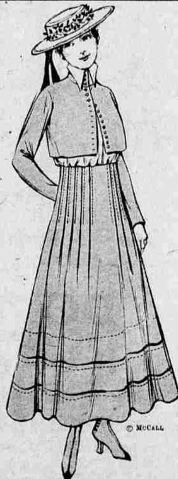
A Rose colored Linen With the New Smart Bolero and the Flaring, Pleated Skirt