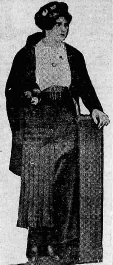
June Hurried Down the Stairs.

"That's her!" Mrs. Boales was pleased. "Some calls her Moore and some Warner and some Justin, but her name's always June. There's a black whiskered man here to see her now. Name's Blye. He's in the parlor." And she craned in at the parlor door with scarcely a shift of her position.