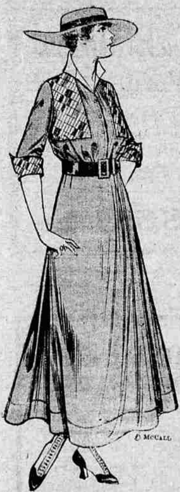
Checked and Plain Voile Combine in This Frock

CHARACTERISTIC COSTUMES THAT ARE FASHIONABLE.