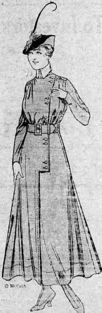
The Trimly Tailored Effect is the Feature of This Frock

khaki and field cloth suits which are the rage of early Spring. Simplicity is the mode in these waists, which button down the front and are sometimes tucked singly or in clusters. High collars, soft, and boned only at the sides, are very popular. These collars should not fit the neck tightly, but wrinkle loosely over the bones. If at all tight, they have lost their style.