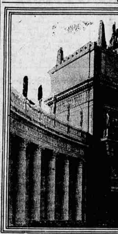
VAST TRIUMPHANT ARCH AT THE WORLD'S GREATEST EXPOSITION, THE PANAMA-PACIFIC INTERNATIONAL EXPOSITION, SAN FRANCISCO, 1915.

Imagine, for the purposes of illustration, the interest, action and novelty of ten great circuses like Barnum & Bailey's combined into a single "greatest show on earth" and presented at ten times the cost of the single production and an idea is gained of the originality of this section.