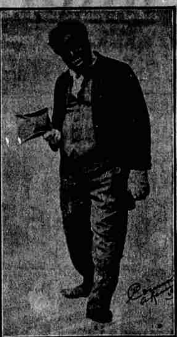
A Minstrel favorite at Arcade soon.