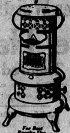
For Best Results Use Pearl Oil