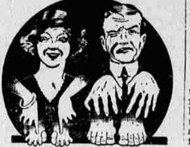
These little toes had "GETS-IT" These little toes had none.

A few drops of "GETS-IT," the biggest seller in the world today of any corn remedy, is enough to spell positive doom to the fiercest corn that ever cemented itself