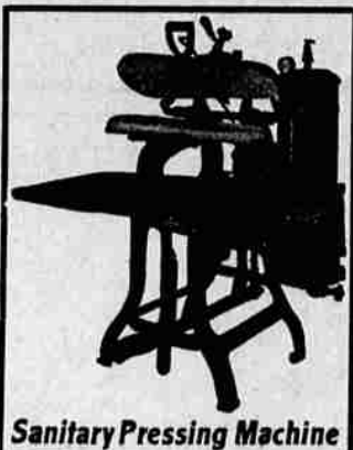
Sanitary Pressing Machine

F. D. HAISTEN Furniture on Easy Payments