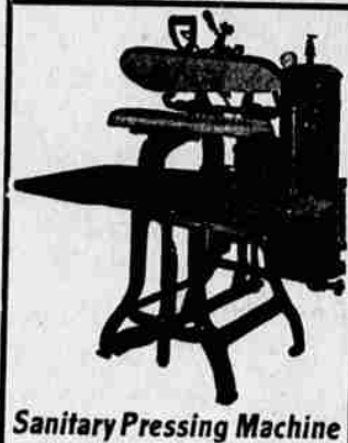
Sanitary Pressing Machine