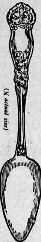
(X actual size)

California Fruit Growers Exchange 139 N. Clark Street, Chicago, Ill. (148)