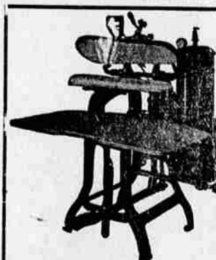
Sanitary Pressing Machine