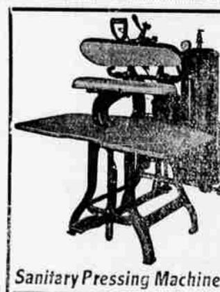
Sanitary Pressing Machine