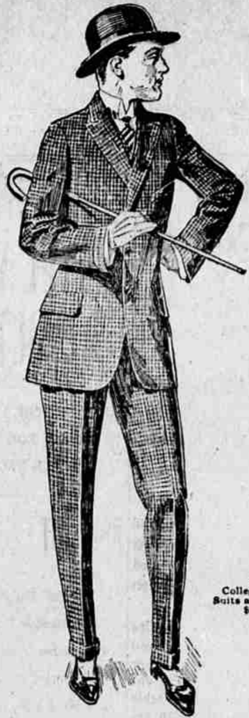
Adler's Collegian Clothes Suits and Overcoats $15 to $35

IN Adler's Collegian Clothes we offer you the finest hand tailored suits and overcoats your money can buy. All the dashing novelties are here, as well as plenty of the more conservative styles, but there isn't a freakish suit or overcoat in the lot. In our assortment you will find just what you want.