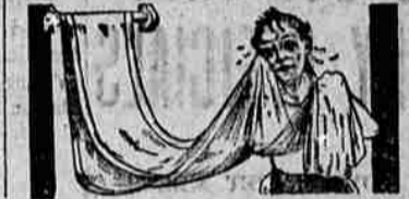
Make Your Blood Pure and Immune With S. S. S.

May be Means of Absorbing Disease Germs in Most Unexpected Manner.