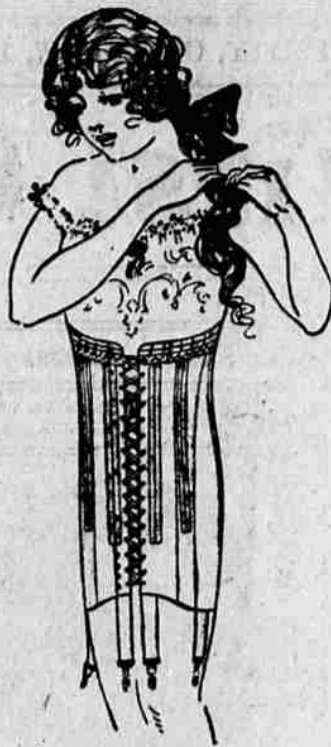
THE CAREFUL MOTHER

In selecting a corset Selects the Gossard for her daughter. She wants her girl to have a sound mind in a sound body. Her family physician has told her of the serious illness which results from constricting the waist line four or five inches. THE GOSSARD CORSETS are cut exactly like a surgical bandage. They gently support the organs, impel correct poise, deep breathing, correct position both sitting and standing, and have beautiful artistic lines. A complete line of Gossard fall models on hand.