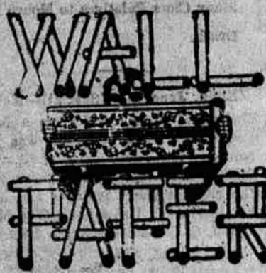
ROLLS AND SCROLLS.

borders and linings—everything in the newest designs in Wall Papers are here in the most artistic patterns and most popular colorings. We are showing a particularly handsome line of parlor and drawing room papers—the kind that will please the discriminating housewife of artistic tastes. The qualities are high but the prices are exceedingly reasonable.