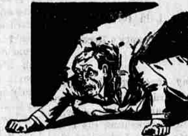
Avoid Grippe, Sore Throat and Similar Troubles by Using S. S. S.

Pneumonia, Bronchitis, Asthma and Anemia Often Directly the Results of Rheumatic Blood.