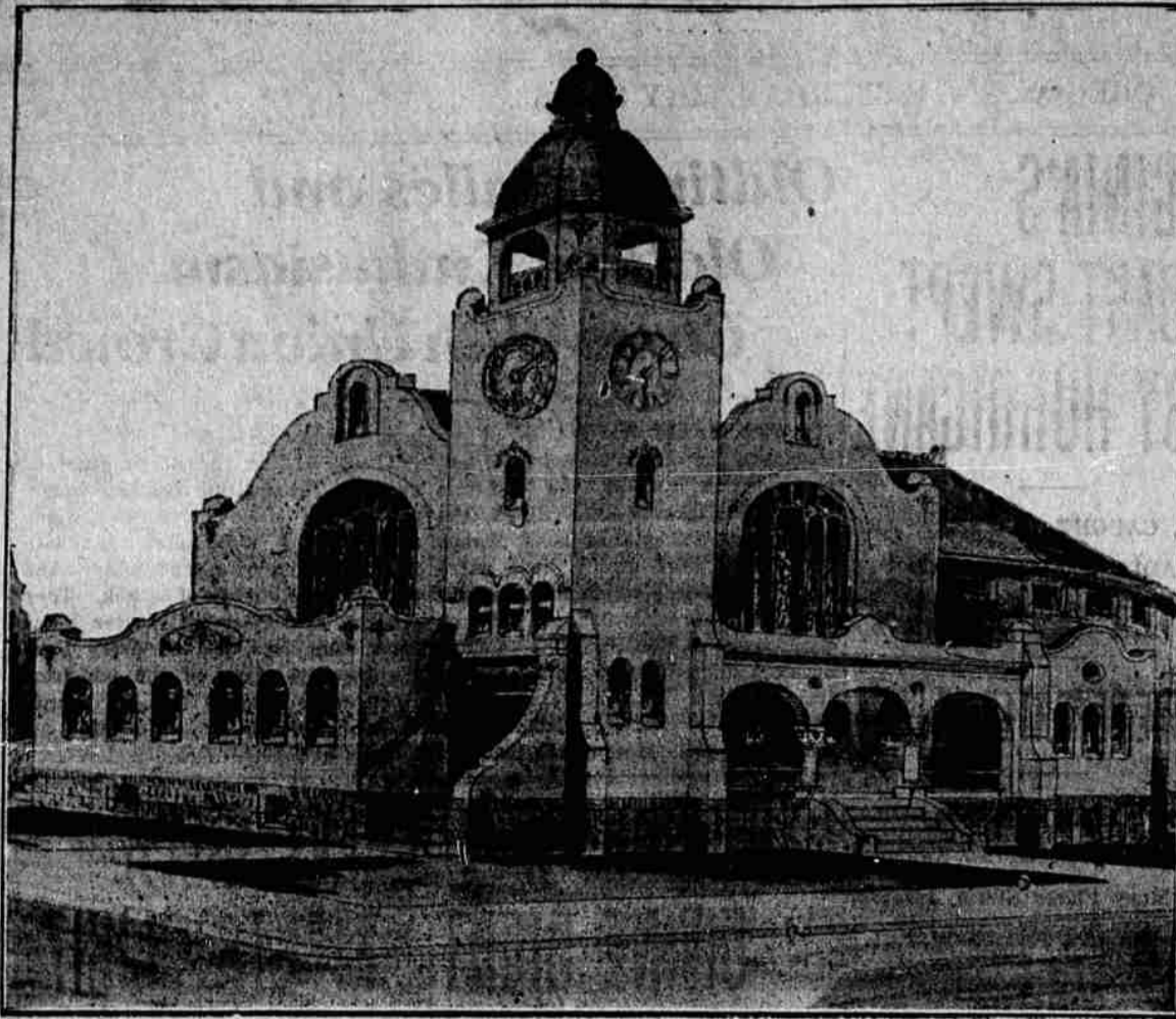
Impressive ceremonies are to attend the laying of the cornerstones of the new Methodist church at Spring and Fourth tomorrow afternoon. The Methodists have an all day program prepared, but during the afternoon especially will there be impressive services when the Masons take charge.

CORNER STONE TO BE LAID IN NEW METHODIST CHURCH SUNDAY AFTERNOON.