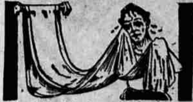
Make Your Blood Pure and Immune With S. S. S.

May be Means of Absorbing Disease Germs in Most Unexpected Manner.