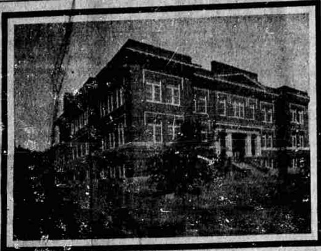
La Grande high school building in which is auditorium that will house audience witnessing "A Box of Monkeys" presented by and under the auspices of the senior class.

Tomorrow night at the big school auditorium a box of monkeys will be released when a half dozen best of the senior class presents the "A Box of Monkeys" for the amusement of parents, friends and the school. All are invited. A nominal fee to cover expenses. A short play will be carried out by the school. A short play will be carried out by the school. A short play will be carried out by the school.