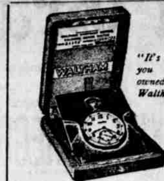
"It's Time you owned a Waltham"

A complete line of the different models always on hand. Prices $3.50, $5.00, $6.50 and $8.50. MRS. ROBT. PATTISON, Phone Red 3221 Corsetiere Res. 1702, Cor. Spring and Oak.