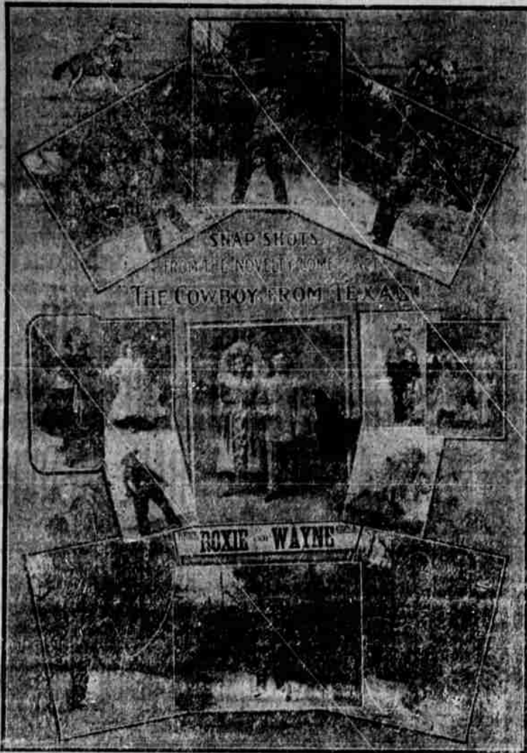
ROXIE AND WAYNE In wild west stunts at the Arcade.

Fruit, Etc. Home grown apples—75c@1.00 a box. Oranges—40c Bananas—40c per doz. Pineapple—20c and 25c, size. Cranberries—15c qt. Grape fruit—(large size) 10c. Vegetables and Miscellaneous. Onions—1.50 per cwt., small lots 2c lb. Potatoes—50c per cwt. Beans—White, 2 1-3c; Lima, 10 cents Cabbage—2c. Celery—15c bunch. (home grown 10c.) Sweet potatoes—5c per lb. Green peppers—20c lb. Squash—2 1/2c lb. Turnips—2 1/2c lb. Eggs and Butter. Fresh eggs—45c. Ranch eggs—45c. Storage eggs—35c. Butter—Fancy creamery, 40 cents, 1 lb. roll; 2 lb. roll, 80c. Ranch butter—1 lb. roll 40; 2 lb. roll 75c. Cattle Heavy fed steers—$6.85 cwt. Choices—$6.60 cwt. Common—$6.25@6.60 cwt. Fancy Cows—$5.75 cwt. Fancy light cows—$5.75 cwt. Heavy calves—$4.00@5.50 cwt. Hogs. Heavy hogs—$6.60 cwt. Medium light hogs—$6.50 cwt. Best light hogs—$6.70 cwt. Sheep. Best lambs—$6.50 cwt. Poor lambs—$4.00 cwt. Yearlings—$4.50 cwt. Ewes—$3.50 cwt. Poultry and Miscellaneous. Ducks,—dressed, 18c. Geese—Dressed 18c.