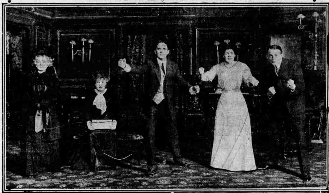
A SCENE FROM "THE LOTTERY MAN."