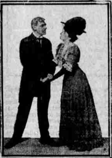
A scene from "The Lion and the Mouse"

A notable feature of Chas. Klein's "The Lion and the Mouse" which the United Play company brings to the