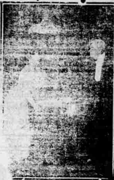
A scene from "The Lion and the Mouse," coming to the Steward next Friday evening.