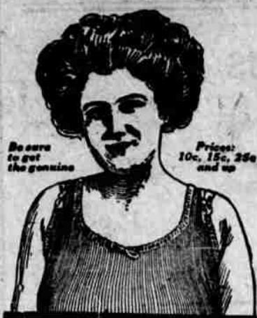
Be sure to get the genuine Prices: 10c, 15c, 25c and up