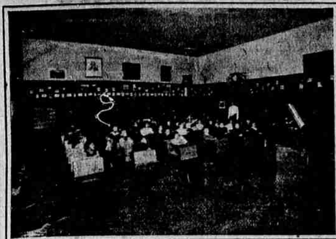
Grade children as well as high school students hear standard classical renditions from Columbia Graphonolas, used in all departments of the school to instruct and sharpen the taste of the best music.