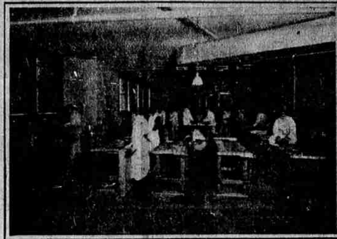
Manual training students at work—notice that girls are anxious to develop hand and brain simultaneously.