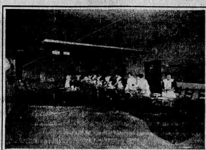
The domestic science rooms are equipped with the best electric stoves. Here is a class at work under Miss Fruit.

Shepherds in Russia do not receive more than 10 to 20 cents a day. The working hours of the members of the Watch Case Engravers' International union have been reduced to 40 a week.