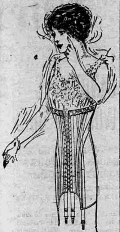
"THE GOSSARD CORSET; THEY LACE IN FRONT."

These By-Laws may be amended at any time by a unanimous vote of the Board of Trustees, or upon the giving of one month's notice of the proposed amendment by a two-thirds vote of the Board of Trustees.