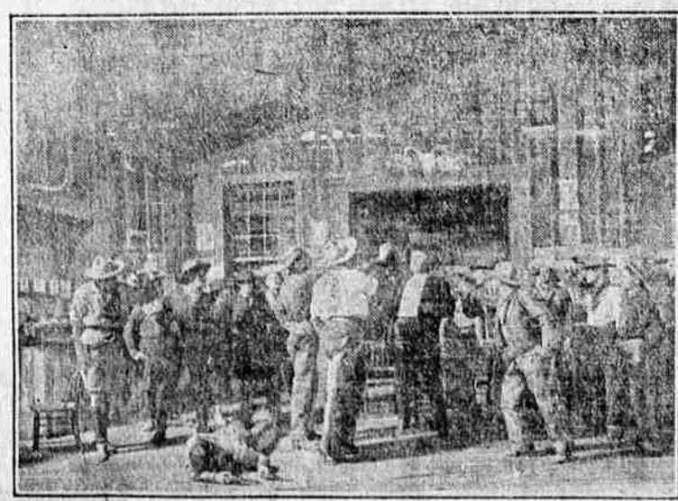
There is always something that appeals to a western crowd in a western story and that is what is given in "The Squaw Man" coming to the Square and Monday night.