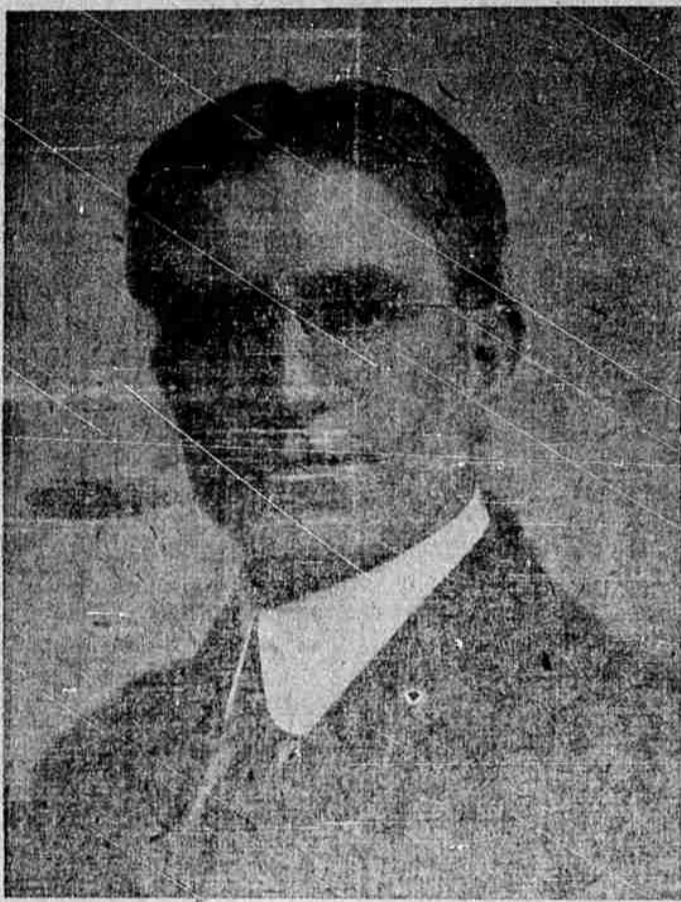
La Grande man who, in the opinion of many, is forging rapidly to the front in the congressional race.

These things may be considered trite, because when recalled, seem so well known. But it is when one aspires to higher and greater duties that his past record speaks louder than any platforms or promises. In this fact alone, voters have every reason to congratulate themselves that when it comes to fill a higher position which in effect is vacant they have within their own city and territory a man whose past performances measure even stronger than his own good promise "that the will of the people shall be his sole guide."