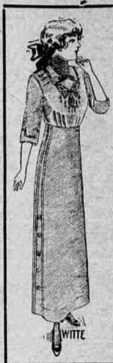
Quality The SAME

$10.50 THERE'S NO GARMENT THAT IS IN GREATER DEMAND NOW. AT THIS PRICE WE ARE SHOWING A NICE LINE. WE ALSO HAVE A NEAT GARMENT IN WHITE SERGE AT $9.50 and $12.00