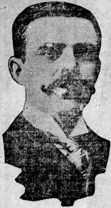
THE PROPER COURSE.

New Chairman of New York Democratic State Committee.