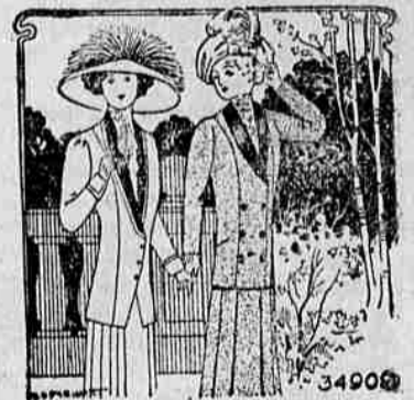
ONE THOUSAND EYES