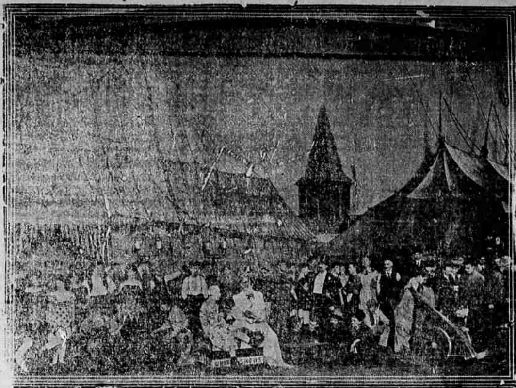
SCENE IN "POLLY OF THE CIRCUS," AT THE STEWARD OPERA HOUSE NEXT MONDAY NIGHT