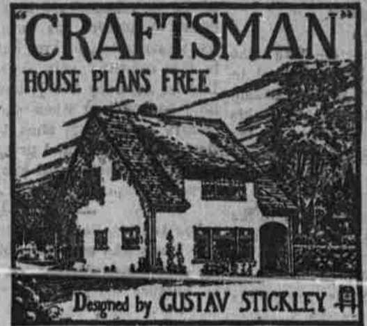
Designed by GUSTAV STICKLEY

You will find that druggists everywhere speak well of Chamberlain's Cough Remedy. They know from long experience in the sale of it that in all dealers.