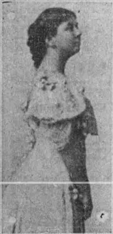
Clever musician who comes to La Grande next Monday evening to give a recital at the Baptist church. Her reputation as a pianist has spread far and wide and she will be one of the best piano performers that has been heard in this city, and some exceedingly clever recitals have been heard here.

life in Vienna, the scenes of which will be illustrated in the programs. The complete program will be published in Monday's Observer.