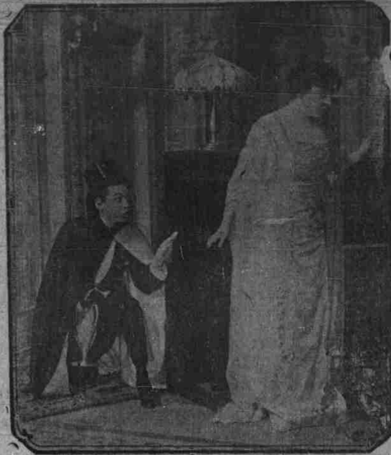
A "GIRL IN THE TAXI" SCENE. AT STEWARD TOMORROW NIGHT.

City Grocery and Bakery The Home of Fancy Groceries. Phone Main 75