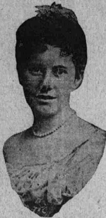
NEWLIN DRUG CO.

Wife of New Minister to Belgium, Who is Successful Author.