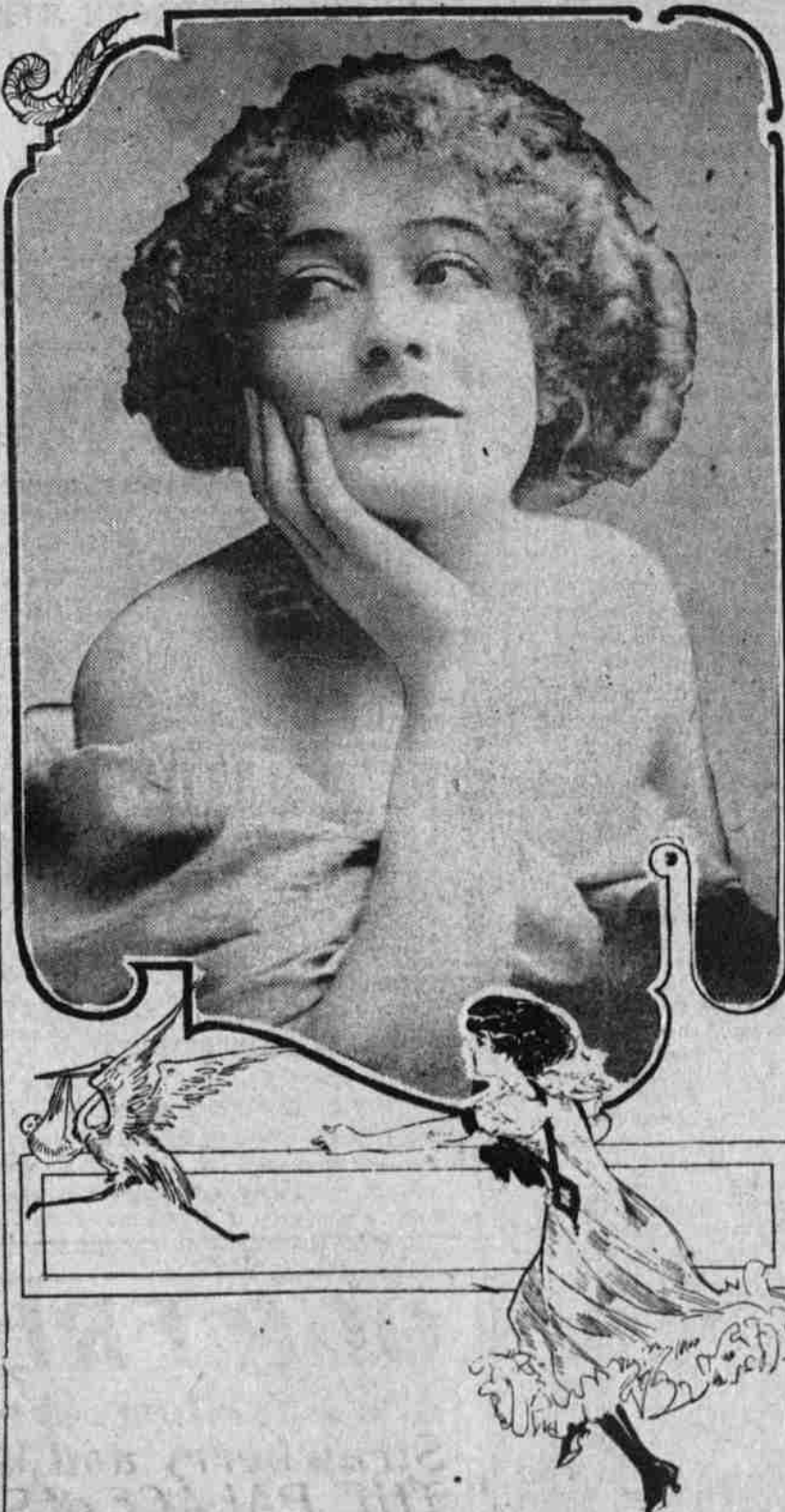
A SCENE FROM "BABY MINE," A COMEDY COMING TO THE STEWARD SATURDAY EVENING.