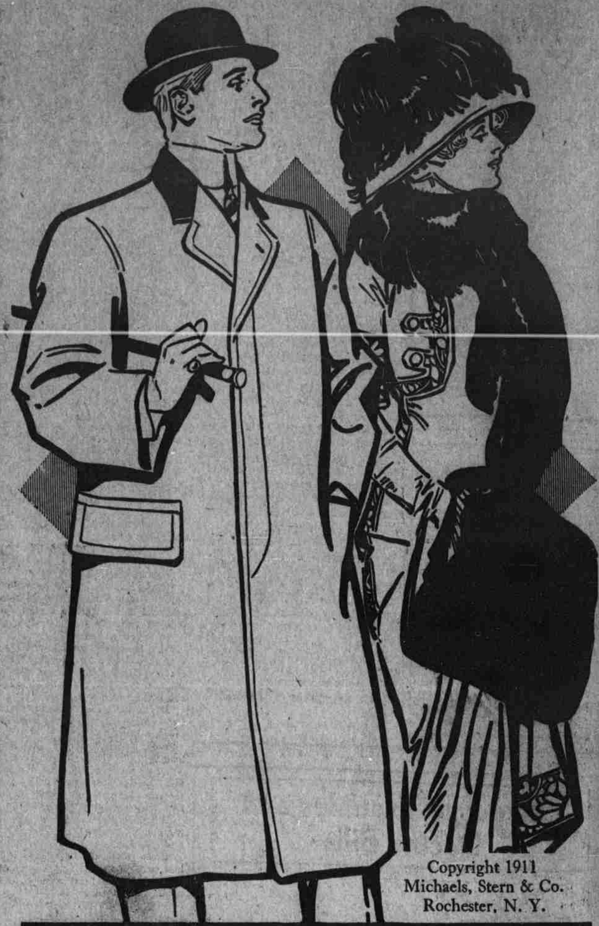
Copyright 1911 Michaels, Stern & Co. Rochester, N. Y.

Sooner or later, you are going to find out that it is decidedly to your best interests to trade here