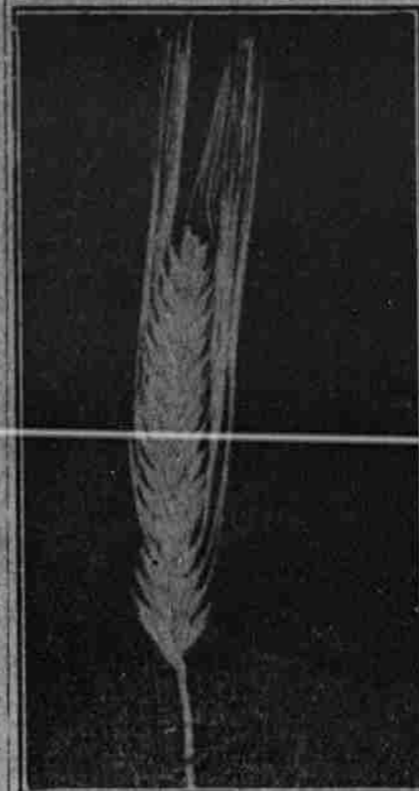
HEAD OF GOLDTHROPE BARLEY.

According to the prevailing opinions, which, according to some American growers, are mere prejudices, the best hops are raised in Bohemia, Bavaria and some parts of England, notably Kent. Most American brewers as well as their European brothers value hops largely by their appearance and their aroma. This matter is being