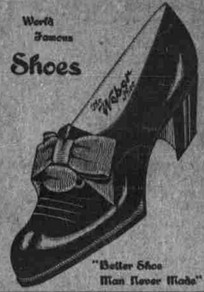
"Better Shoe Man Never Made"

We will close out our Oxford Shoe lines.