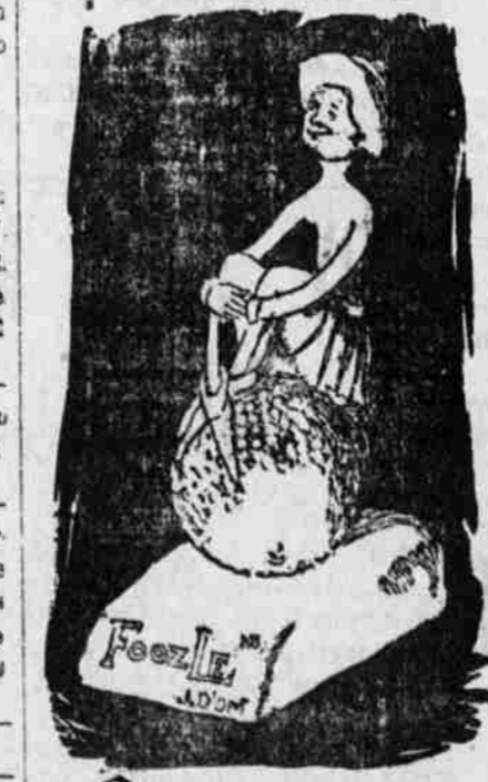
"FOZZIE," GOD OF GOLF THINGS AS THEY OUGHT NOT TO BE.

Only "Fozzie" is the Devil, as Every Golfer Knows. And here is another mascot—not "god of things as they ought to be," but "fozzie," and no one ever wants