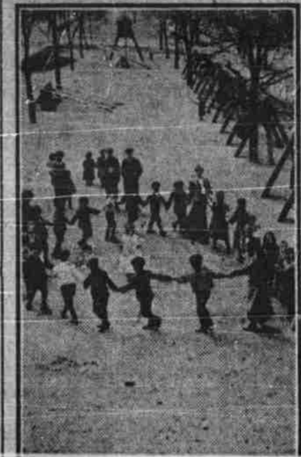
AT PLAY IN PUBLIC PLAYGROUND.

The warmer the weather gets the more do the children want to play. But where can they frolic and run about as they like? Almost every town in this country, including our own, is confronted with this question. Some have answered the question already by either providing a public