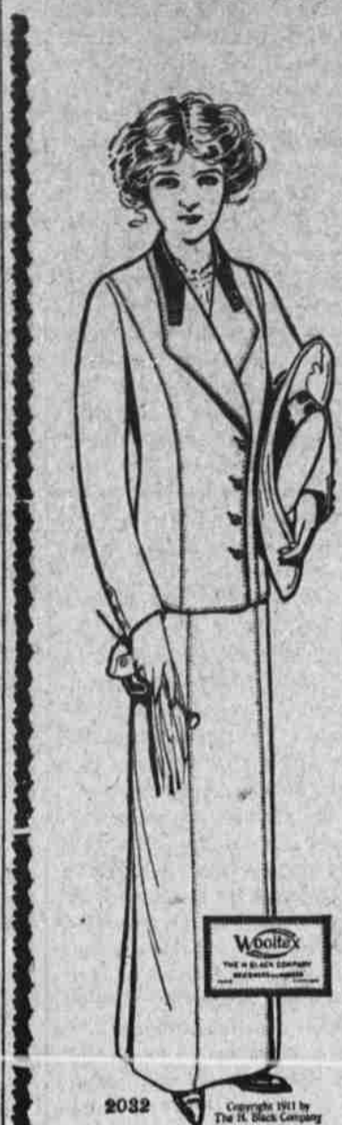
2032

So remarkable was the sight of this pink clad trunk perched on his big horse that a child who once saw him